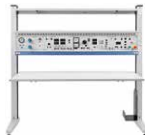
Multifunctional Workplace System