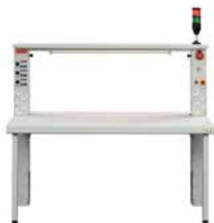
Electrical Workspace: An Ergonomically Designed System