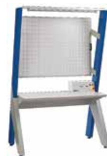
Electrical Workspace: Educational, Training and Teaching System