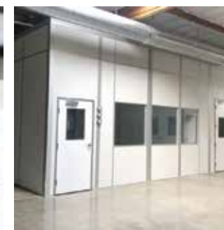
3D Printing Technology