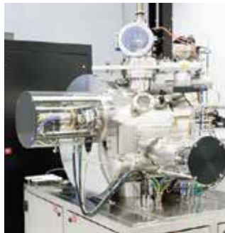
Nano Technology & Materials